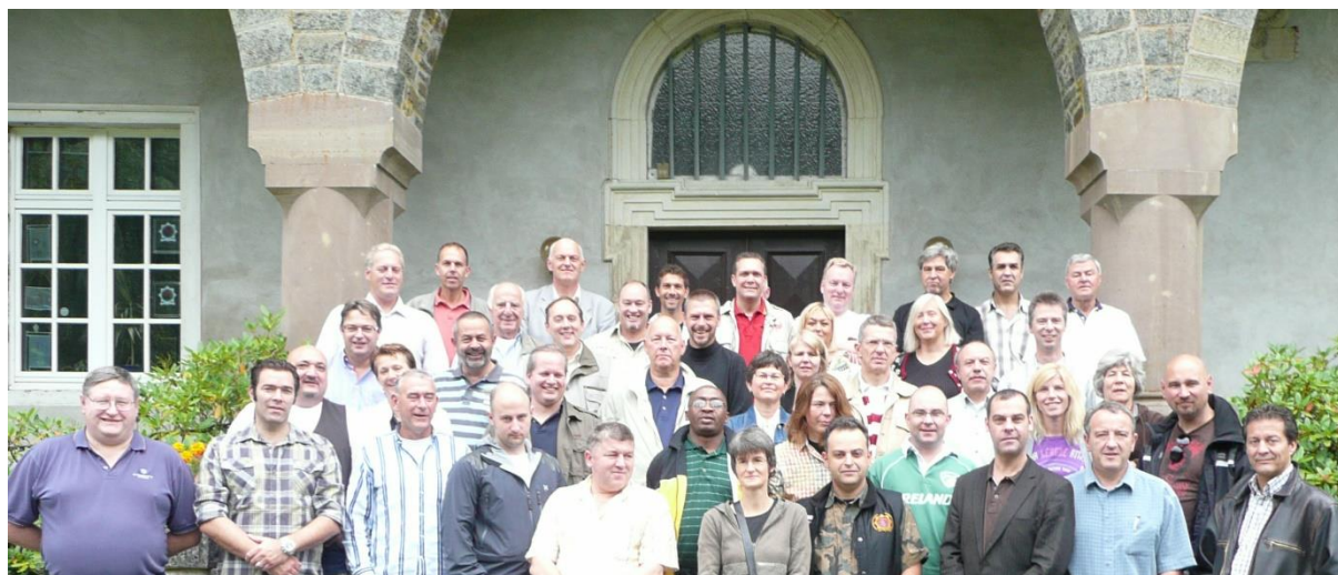
Schloss Gimborn: A meeting place for IPA friends from around the World

IBZ Gimborn was set up as a meeting place for IPA members from around the world and developed into the fine educational establishment we have today. It welcomes not only IPA members at a reduced participation fee, but serving and retired members of the police service, both sworn and support staff. Family members are also welcome. The castle furthermore is available to members as a holiday base, for exploring the beautiful local area by car, motorbike or bicycle.