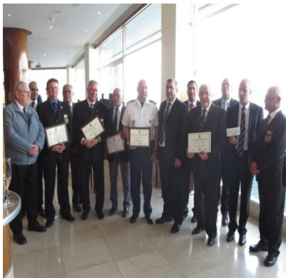
IPA Monaco awards