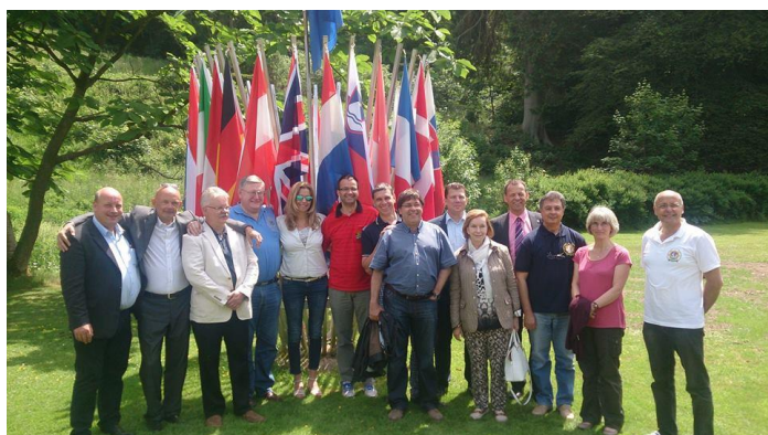
The IEB and the board of IBZ Gimborn in the grounds of the castle

It was essential to come together at a time when many questions are being asked regarding the cooperation between the IPA and IBZ Gimborn. The importance of the meeting was reflected in the fact that in addition to the IEB, the entire board of Gimborn attended the joint meeting.